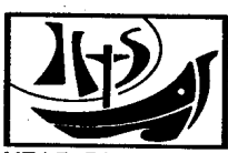
YEAR OF FAITH

HURRICANE SANDY --Through your generosity, the Archdiocese has so far collected $86,084 for the victims of Hurricane Sandy. Catholic Charities USA is disbursing the funds in the affected eastern states. Catholic Relief Services is assisting in the Caribbean and Latin America. Thank you for your donations!