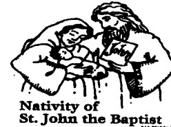
Nativity of St. John the Baptist