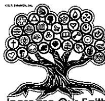
Increase Our Faith