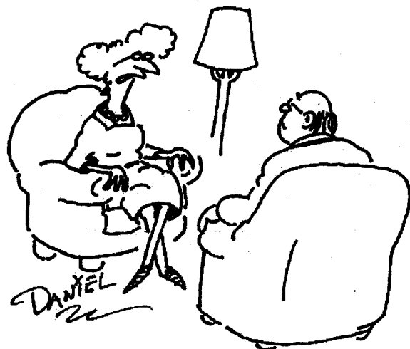
"I DON'T LIKE TO SPREAD GOSSIP, PASTOR, BUT WHAT ELSE CAN YOU DO WITH IT?"