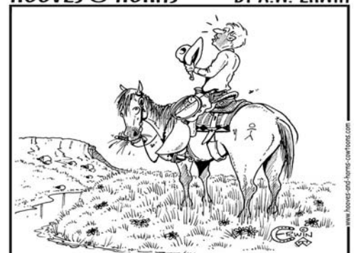
"Lord.... It's me again....Yuh know, The one that keeps pesterin' yew 'bout rain,.... THANKS!"