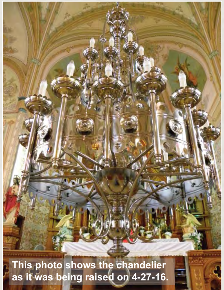
This photo shows the chandelier as it was being raised on 4-27-16.

The refinishing of the chandelier at St. Mary's Parish was made possible in great measure by the Wilfred Bergman Memorial and other donations. A special thanks also to the parishioners who worked to remove and reinstall the light.