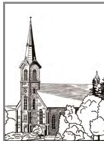
Faith Moves Us Forward

A reception will follow the recital in the parish hall. The event is open to the public. Parishioners are encouraged to attend.