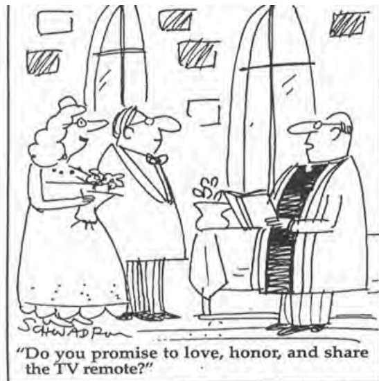
from The Joyful Noiseletter

If you would like to send an announcement to the parish bulletin, email to: Email: pastor@shbaileyville.com OR call : 785-336-6464 OR Mail to: P.O. Box 36, Baileyville, KS 66404 Bulletin announcements must be submitted by Wednesday of the week.