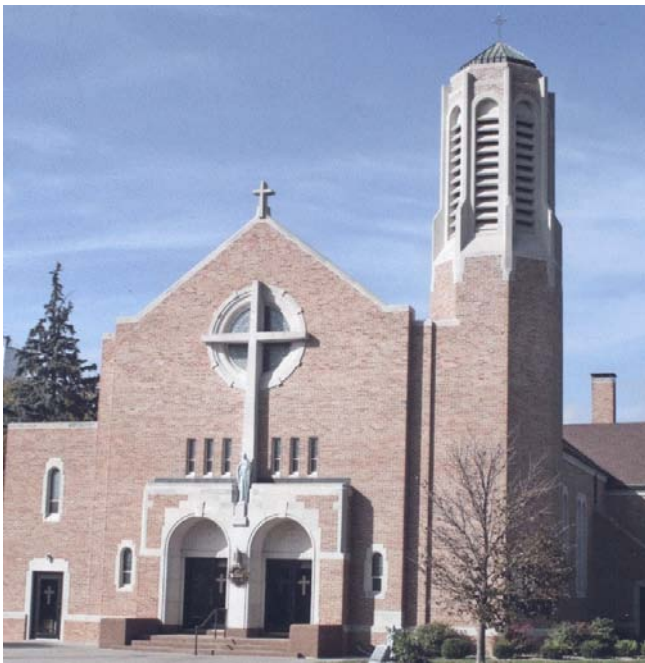
Sacred Heart Church

357 N Third Street, Baileyville, KS 66404