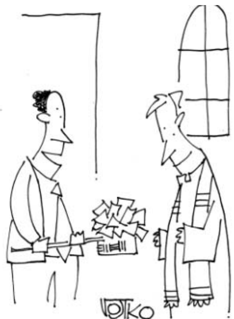
"The budget committee was wondering if you'd give the same sermon next Sunday."

Please join us for the 2nd Archdiocese of Kansas City Kansas Rural Catholic Youth Conference! RCYC will be held in Topeka on November 17-18, 2018 .