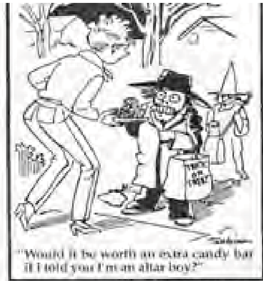
"Would it be worth an extra candy bar if I told you I'm an altar boy?"