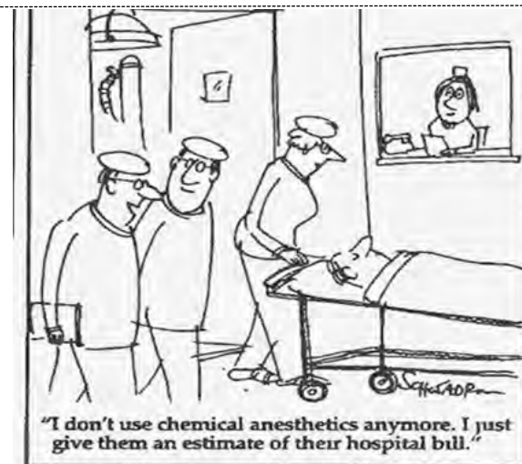
from The Joyful Noiseletter ©Harley L. Schwadron Reprinted with permission