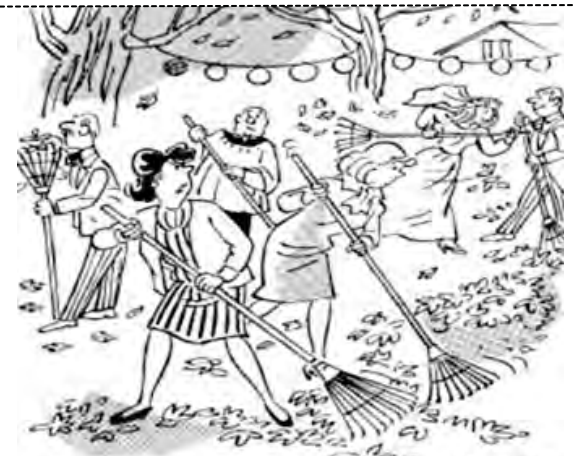
"We should've suspected something when she said the wedding would be outdoors at her folks' place."