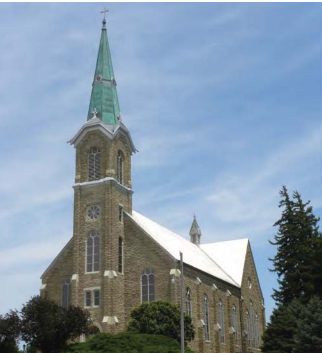
St. Mary's Church

9208 Main Street, St. Benedict, KS 66404