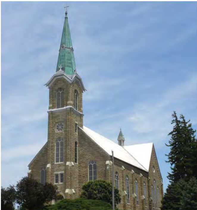
St. Mary's Church

9208 Main Street, St. Benedict, KS 66404