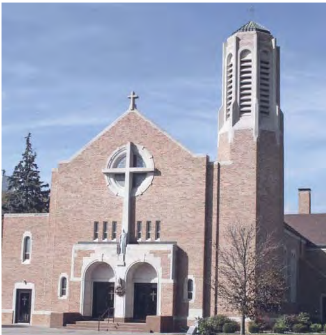
Sacred Heart Church

Youth (Grades 6-12) - Wednesdays 7:30 - 8:30pm