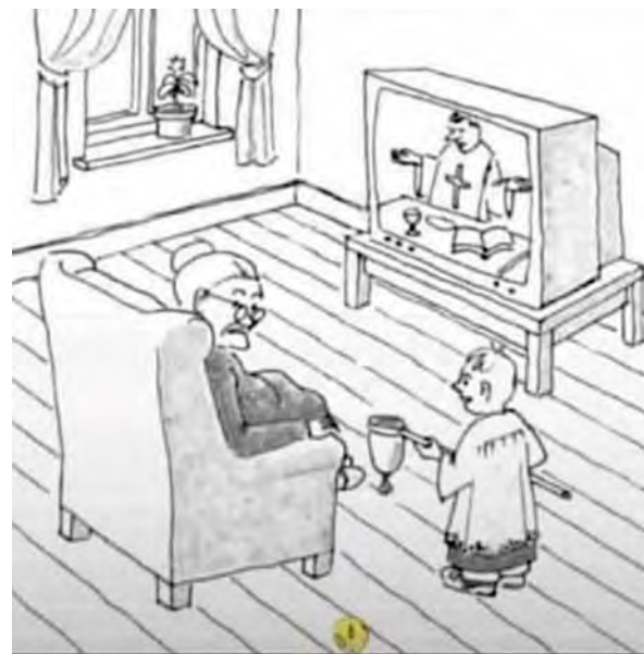
"Granny watching Mass on TV and Grandson taking collection..."

Inspired by the True Story, this new movie 'Fatima' is scheduled to be released on August 14. A powerful and uplifting drama about the power of faith, Fatima tells the story of a 10-year old shepherd and her two young cousins in Fatima, Portugal, who report seeing visions of the Virgin Mary. Their revelations inspire believers but anger officials of both the Church and the secular government, who try to force them to recant their story. As word of their prophecy spreads, tens of thousands of religious pilgrims flock to the site in hopes of witnessing a miracle. What they experience will change their lives forever. Be on the lookout. 🧐