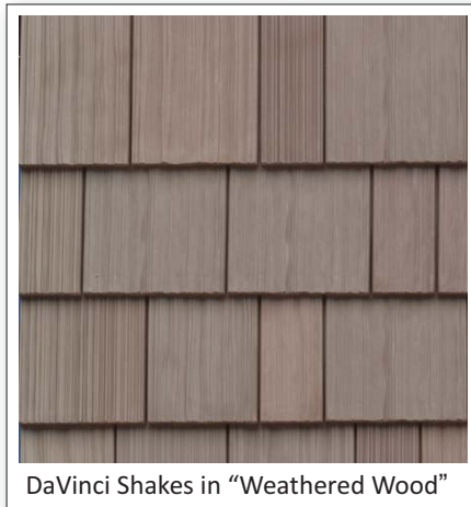
DaVinci Shakes in "Weathered Wood"