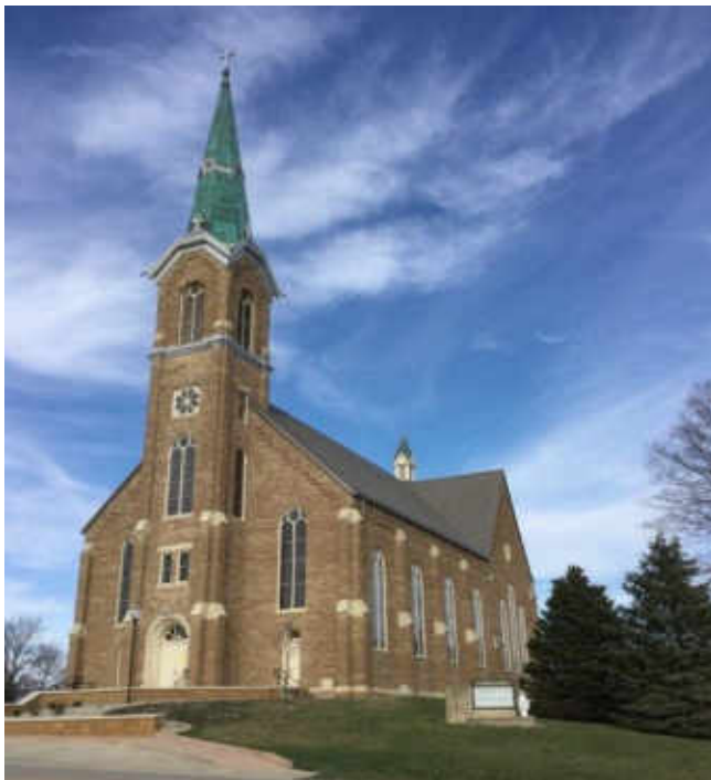
St. Mary's Church

9208 Main Street, St. Benedict, KS 66404